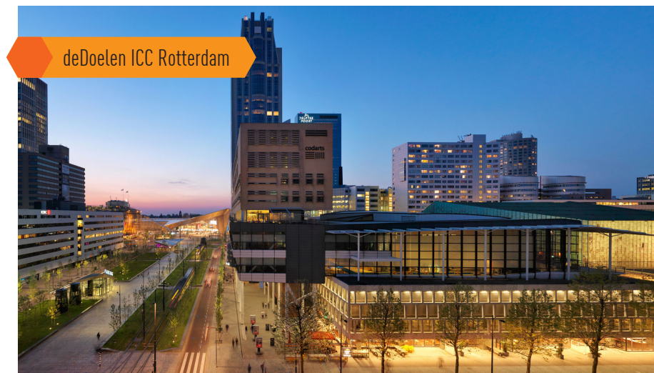
deDoelen ICC Rotterdam